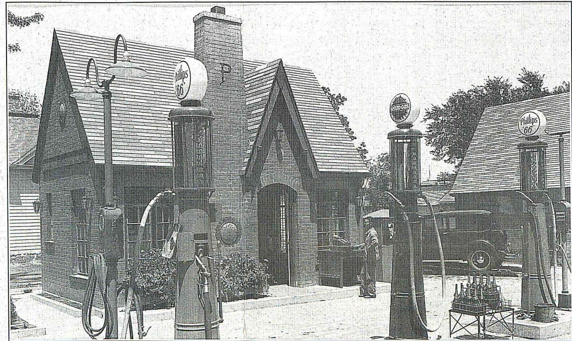
Your Friendly Neighborhood Gas Cottage

Pledges may also be returned to Iowa State or First National Banks in Creston.